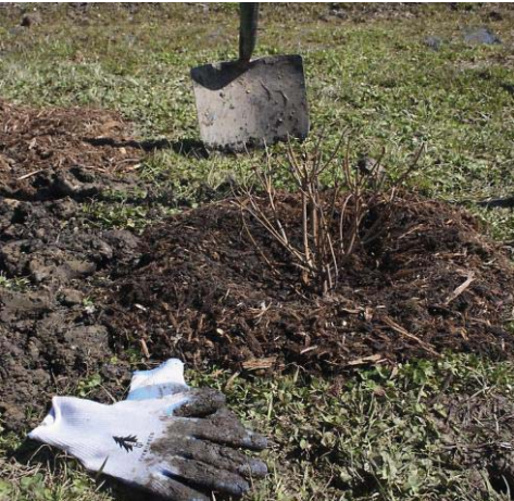
Mulch moves...have students help tidy mulch regularly

Make sure that parents of students allergic to dust and mould are aware of the activity and take the precautions they recommend.