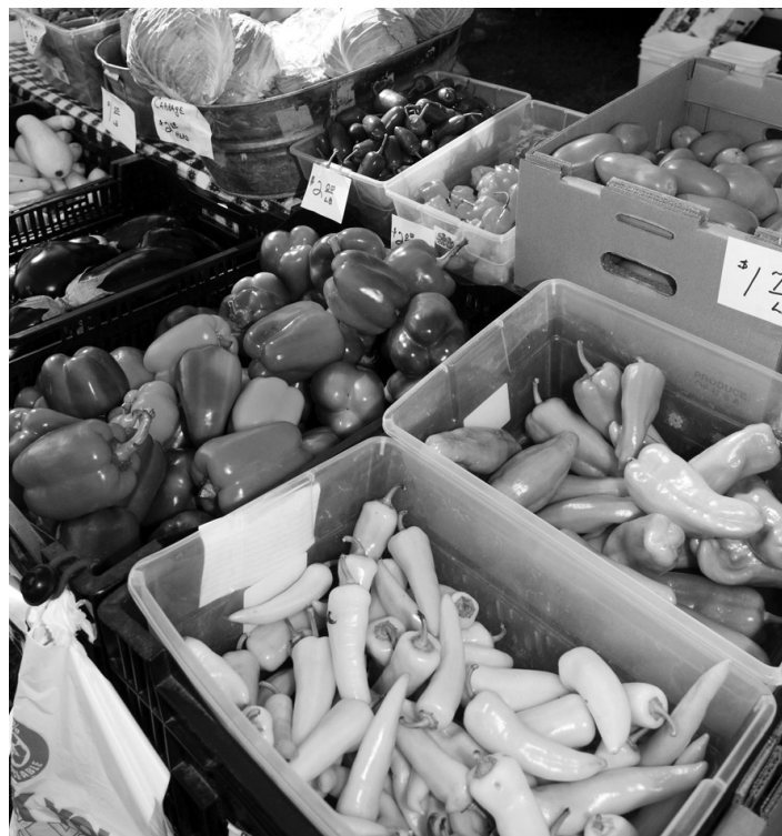
Encouraging greater access to fresh fruits and vegetables.

Virginia Farm to Table Team and the Virginia Food System Council