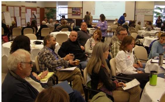
Participants at the Shenandoah Valley Farm-to-Table Summit providing key input to the Plan.

“I know of no pursuit in which more real and important services can be rendered to any country than by improving its agriculture.”