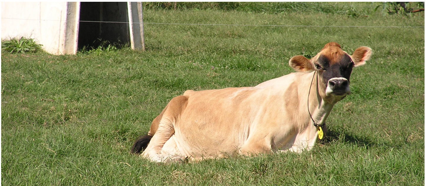
Exploring value-added enterprises like on-farm milk processing.