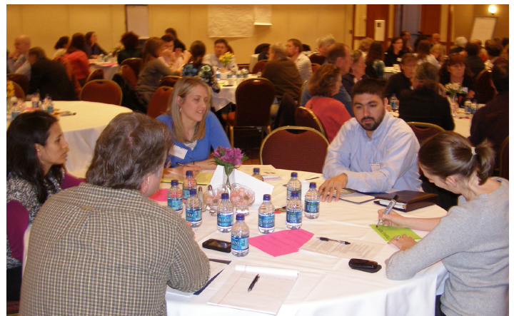
Discussing market development at the Forum in Blacksburg.

development, 3) community viability and environmental stewardship, and 4) food access, nutrition and health.