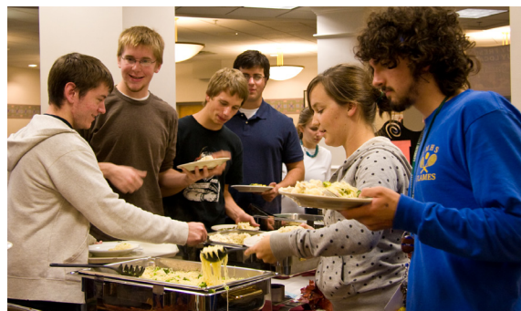
Students enjoying a local harvest meal at Eastern Mennonite University.

Economic leakage simply means total sales and economic output within an area are not as much as they could be based on the area’s population, income, capacity and existing resources.