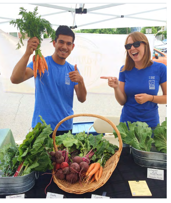
DUG Farm Stand