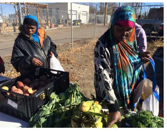
Denver Food Rescue distribution