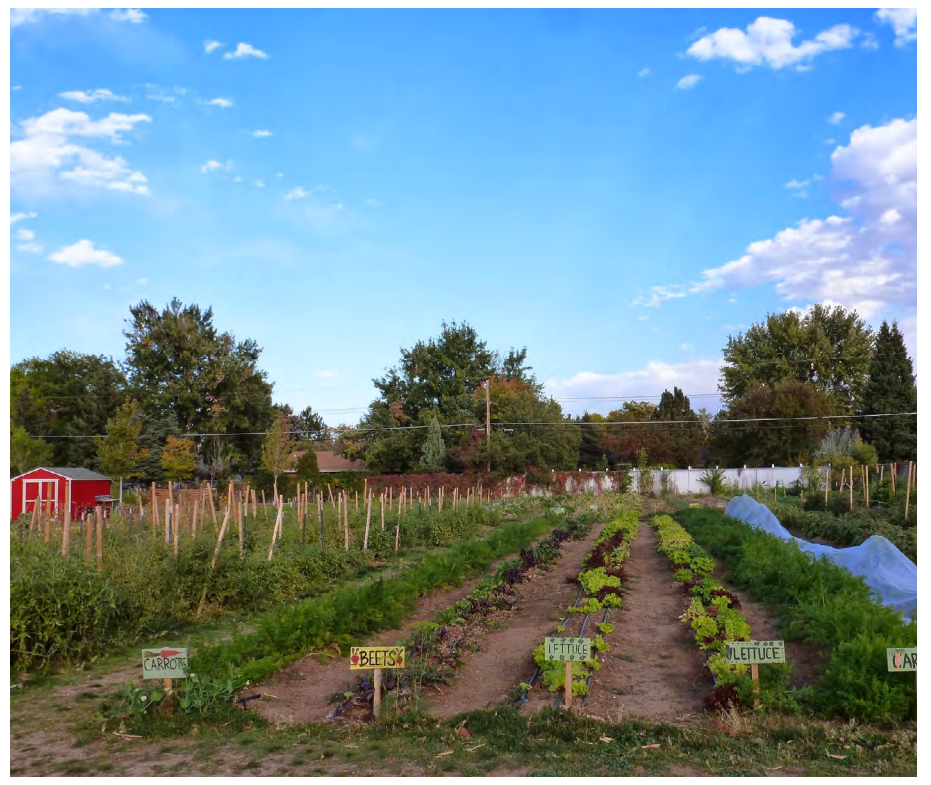
Sprout City Farms

Ensure equitable access to nutritious and affordable food as the foundation and catalyst for health improvement for all.