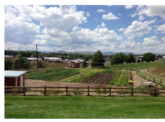
Delaney Urban Farm

R2.C. Promote education on residential and public efforts to protect pollinators and provide pollinator habitats