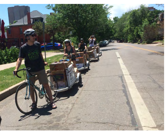
Denver Food Rescue volunteers transporting rescued food on bikes