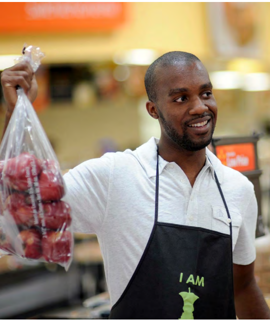
Cooking Matters Grocery Store Tour