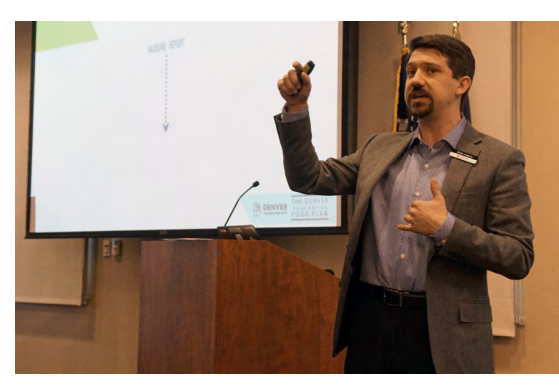
Community Listening Session