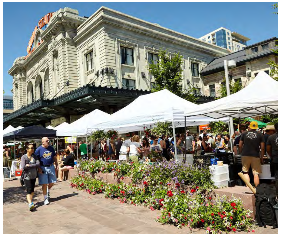
Denver Union Station Farmers Market

Leverage the strength of Denver's food businesses to accelerate economic opportunity across the city.