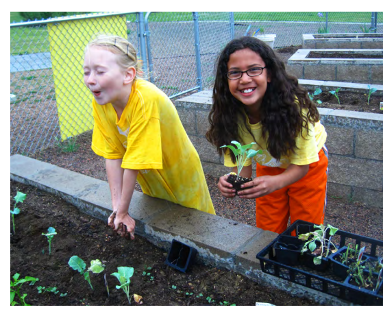
Students planting in community garden

a community-defined set of food amenities (that could include grocery stores, farmers' markets, school gardens, etc.) that together provide for the food needs of all community members, integrating the unique cultures and values of each neighborhood.