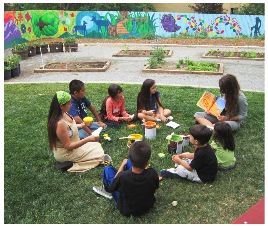
Students reading in Denver Urban Garden (DUG) community garden

Engage and support communities in building vibrant, beautiful, and complete neighborhood food environments.