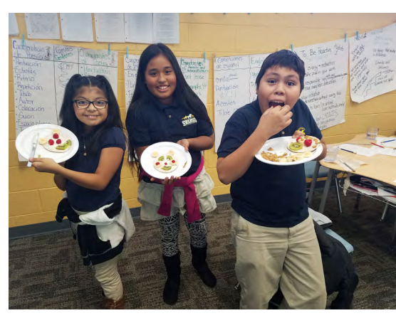
Students learning about nutrition

Food Insecurity is defined by the USDA as the state of being without reliable access to a sufficient quantity of affordable, nutritious food.